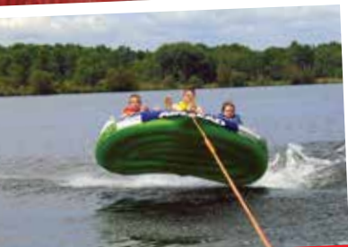
Adrenaline pumping action!