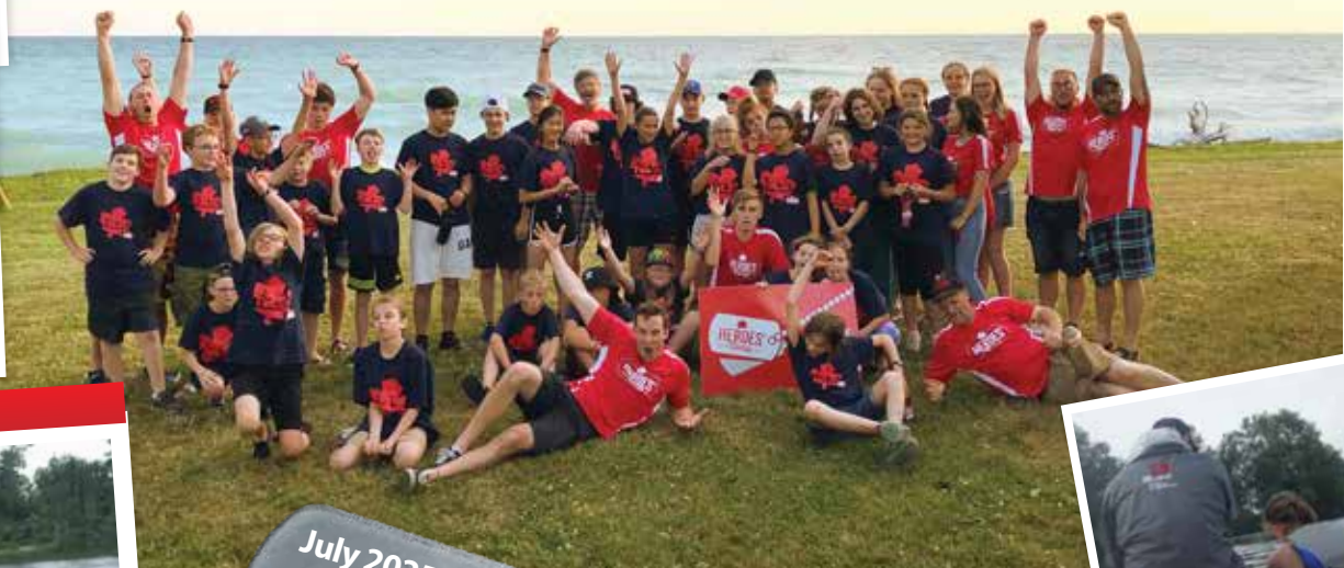
Camp is SO much fun.